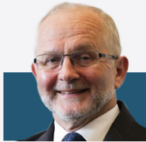
Sir Philip Craven MBE INED; Chair of Nominations and Remuneration Committee